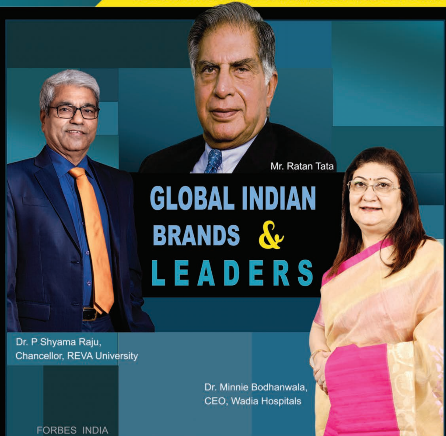
Mr. Ratan Tata

GLOBALLY RECOGNISED INDIAN BUSINESS LEADERS