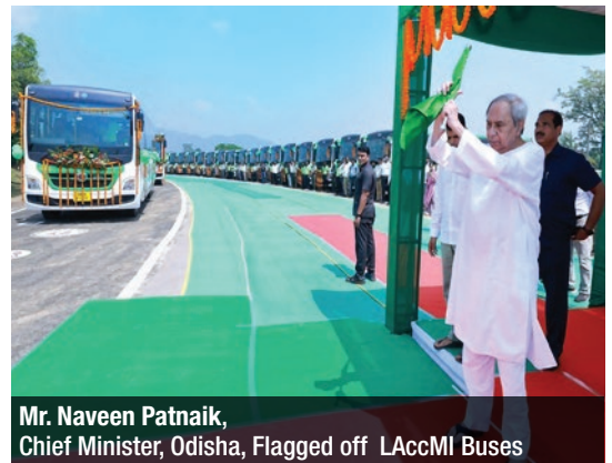
Mr. Naveen Patnaik, Chief Minister, Odisha, Flagged off LAccMI Buses

timeframe, contributing to improved livelihoods and prosperity.